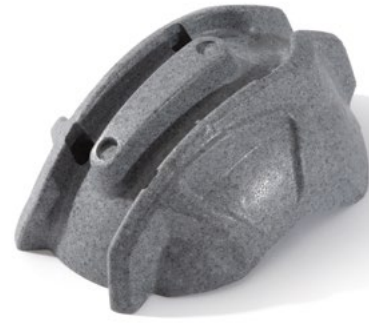
Impact Absorber Part # 16-521