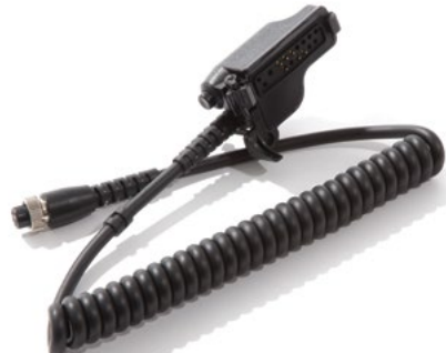
Motorola Connection Cable (multi-pin) Part # 09-934