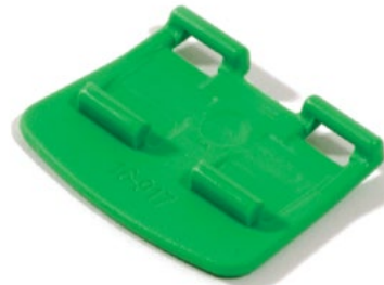
Latch Part # 16-917