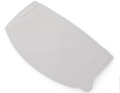
Peel-off Lens (pk 50) Part # 07-123