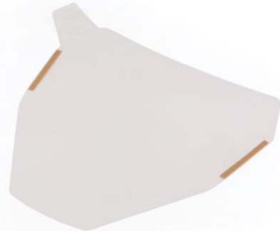
T-Link® Peel-off Lens (pk 25) Part # 17-815