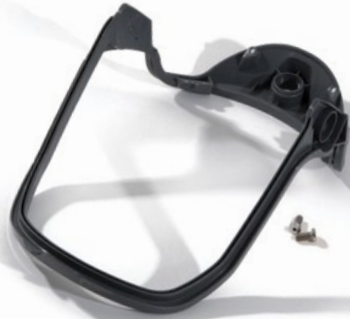
Jaw (includes 16-515) Part # 16-514