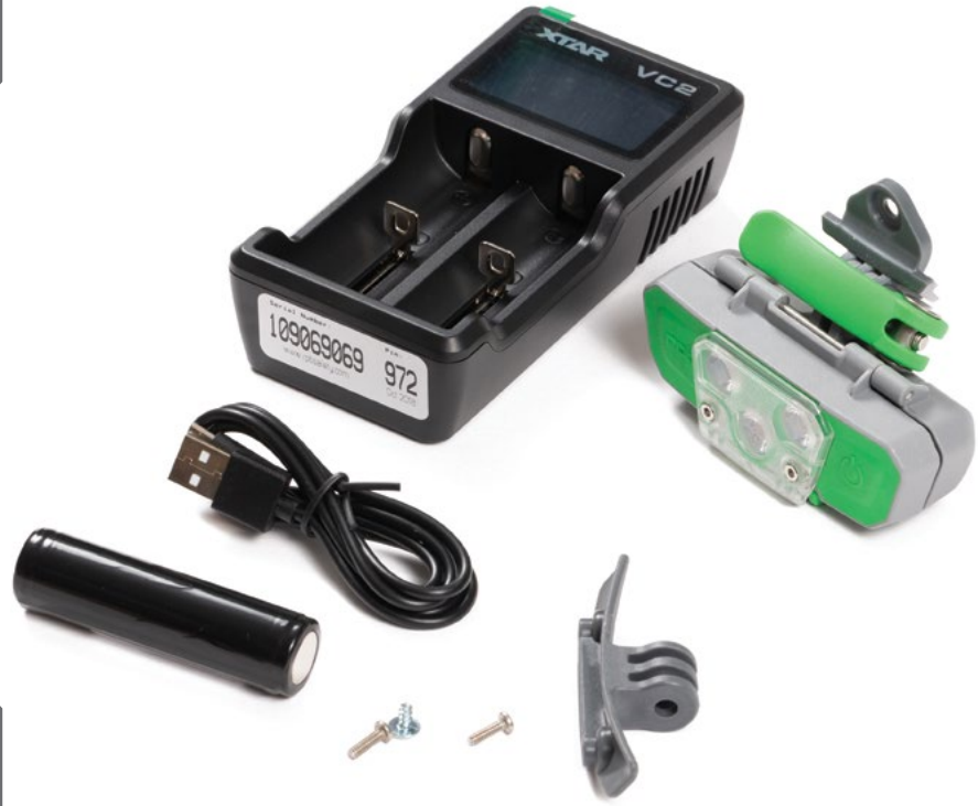
Vision-Link™ (includes 09-510-RAW, 16-918, 15-839) Part # 16-901