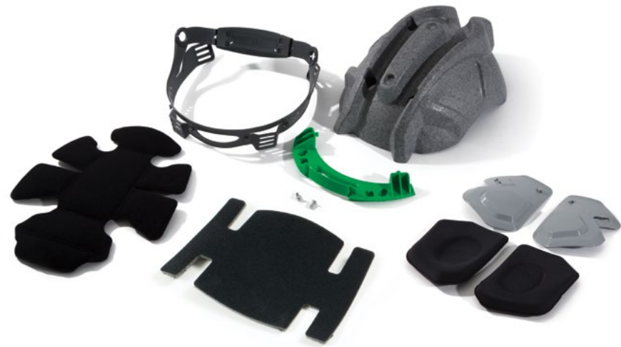
Fit System (includes 16-520-S, 16-521, 16-522, 16-525, 16-526, 16-530, 16-531) Part # 16-520-T