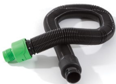
PX4 Air® Breathing Tube (for T-Link®) Part # 04-835