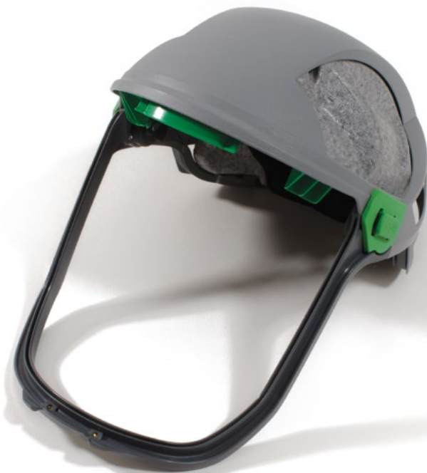
T-Link® Bump Cap Assembly Part # 17-110