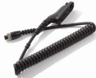
Motorola Connection Cable (multi-pin) Part # 09-932