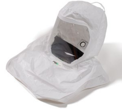
Tychem® 2000 Hood Part # 17-712