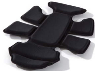
Comfort Pad Part # 16-522