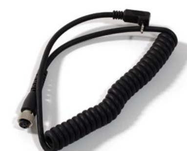
Motorola Connection Cable (single-pin) Part # 09-935