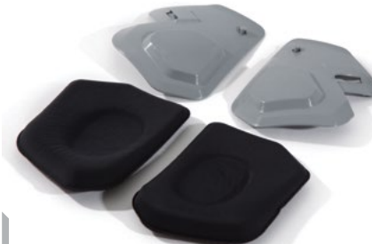
Side Padding System Part # 16-520-S