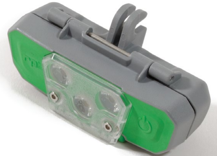
Light (does not include battery or charger) Part # 16-910