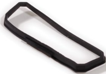
Cowling Seal Part # 16-915