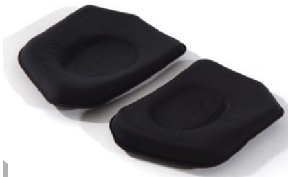
Foam Side Pads Part # 16-528