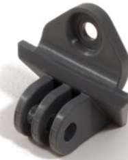
Jaw Mount (for Z-Link® and Z4®, does not include screw) Part # 15-839