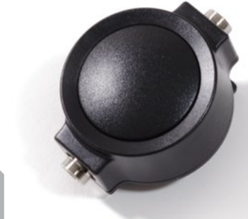
Communication Retainer Clip Part # 16-529