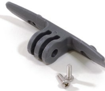
Jaw Mount (for Z-Link® and Z4®, does not include screw) Part # 15-839