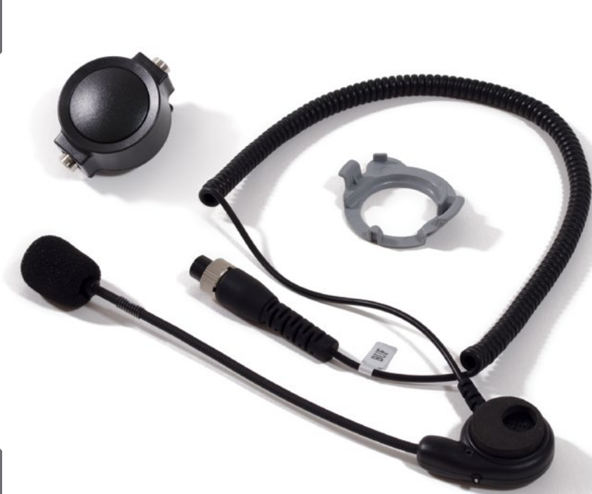
Communication System (includes 16-529 and 09-913) (Comms-Link™ System requires 16-520-S Side Padding System) Part # 16-922