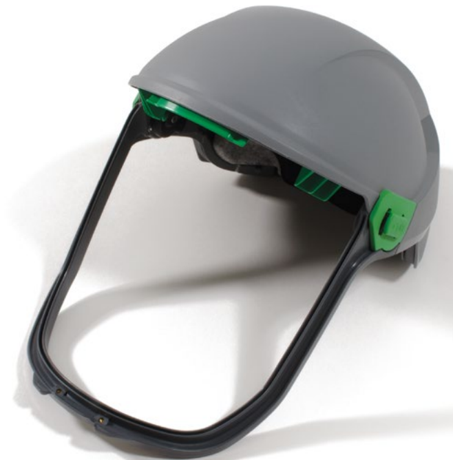
T-Link® Hard Hat Assembly Part # 17-010