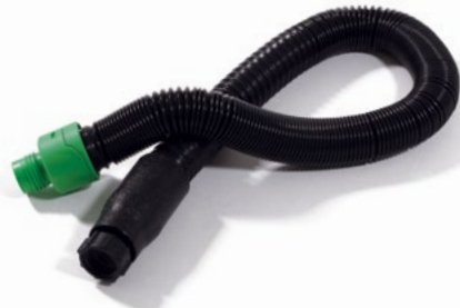
Supplied Air Breathing Tube (for T-Link®) Part # 04-830