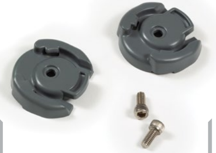
Earmuff Bracket (pair, includes screws) Part # 16-516