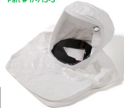
Tychem® 4000 Hood with Sealed Seams, Safety Lens Part # 17-713-S