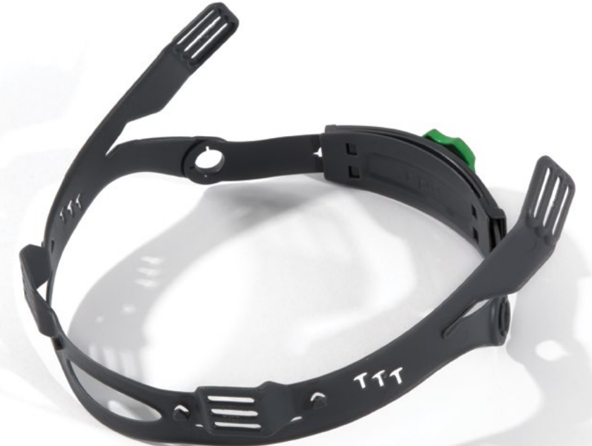
Head Harness (includes 16-530) Part # 16-531