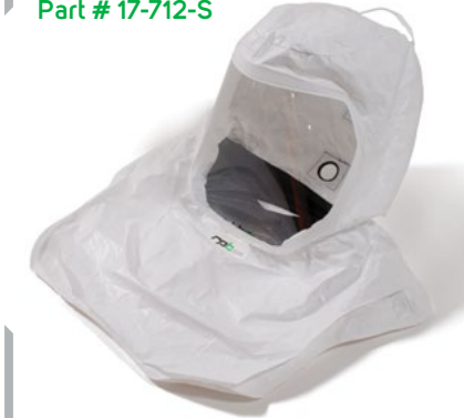
Tychem® 2000 Hood with Safety Lens Part # 17-712-S