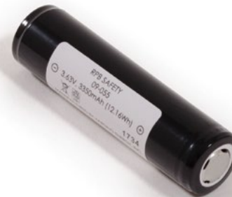
Battery Part # 09-055