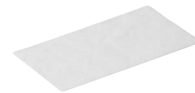
Pre-filter (pk 10) Part # 03-890