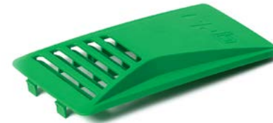
Door Cover Part # 03-812