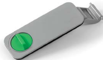
Battery Door Assembly (includes 03-818) Part # 03-815