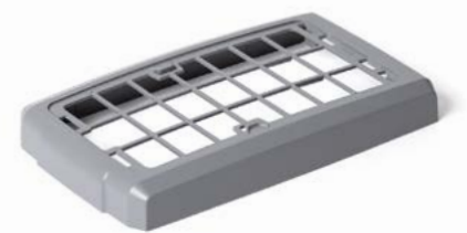
HEPA Cartridge/Filter Door Part # 03-813