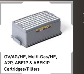
OV/AG/HE, Multi-Gas/HE, A2P, ABE1P & ABEK1P Cartridges/Filters

HEPA cartridge/filter - removes up to 99.97% of particulates down to 0.12 microns. Gas cartridges/filters protects against organic vapor exposure. Replace the pre-filter daily to extend the life of the main cartridge/filter.