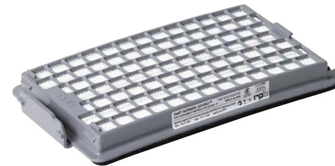
HEPA Cartridge/Filter Part # 03-892