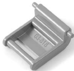
Battery Door Hinge (retainer) Part # 03-818