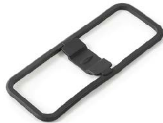
Battery Door Seal Part # 03-817