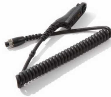
Motorola Connection Cable (multi-pin) Part # 09-932