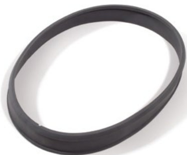
Cape Cover Band Part # NV3-759