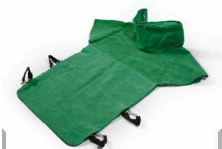
Extra Length Leather Respirator Cape Part # NV3-753