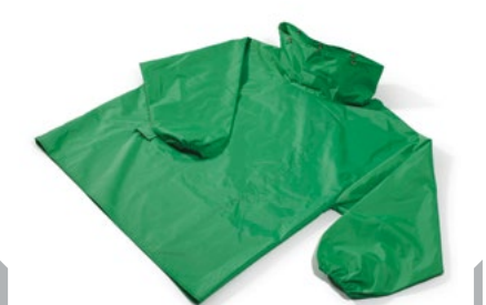
Blast Jacket size XL Part # NV3-754