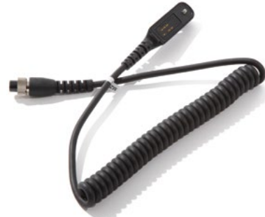
Kenwood Connection Cable (two-pin) Part # 09-933