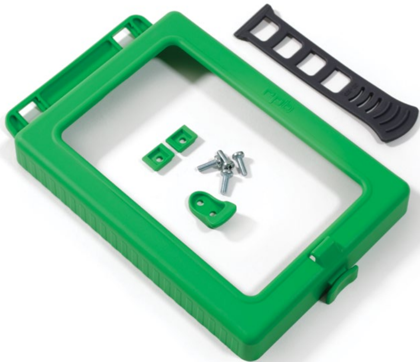
Visor Kit (includes 4pcs FS-40 nuts) Part # NV1-124