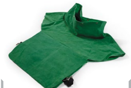
Leather Respirator Cape Part # NV3-752