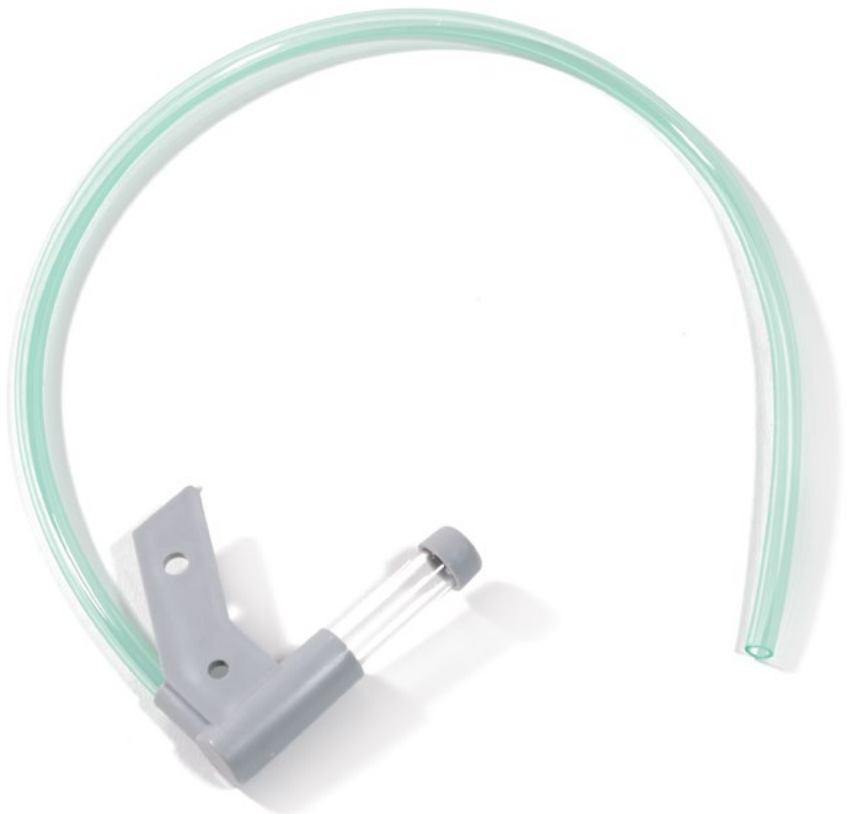
Low Flow Indicator Assembly Part # NV2030