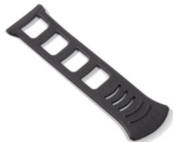
Visor Strap (pk 5) Part # NV1-125