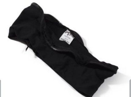
Inner Bib Part # NV2012