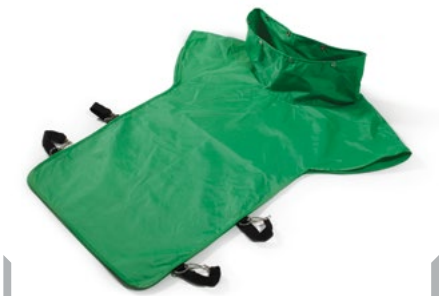
Extra Length Nylon Respirator Cape Part # NV3-751