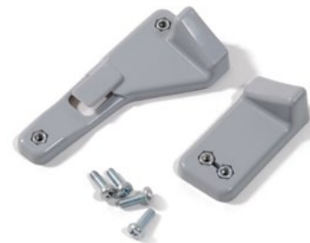
Helmet Dome Holder Part # NV1-123