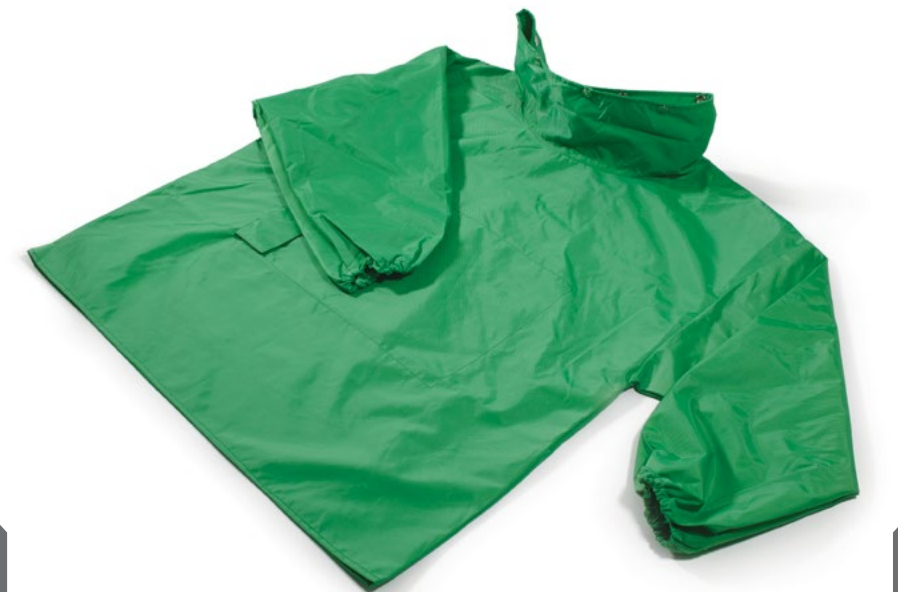
Blast Jacket size XXL Part # NV3-755