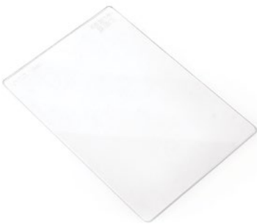
Inner Lens (pk 10) Part # 02-810